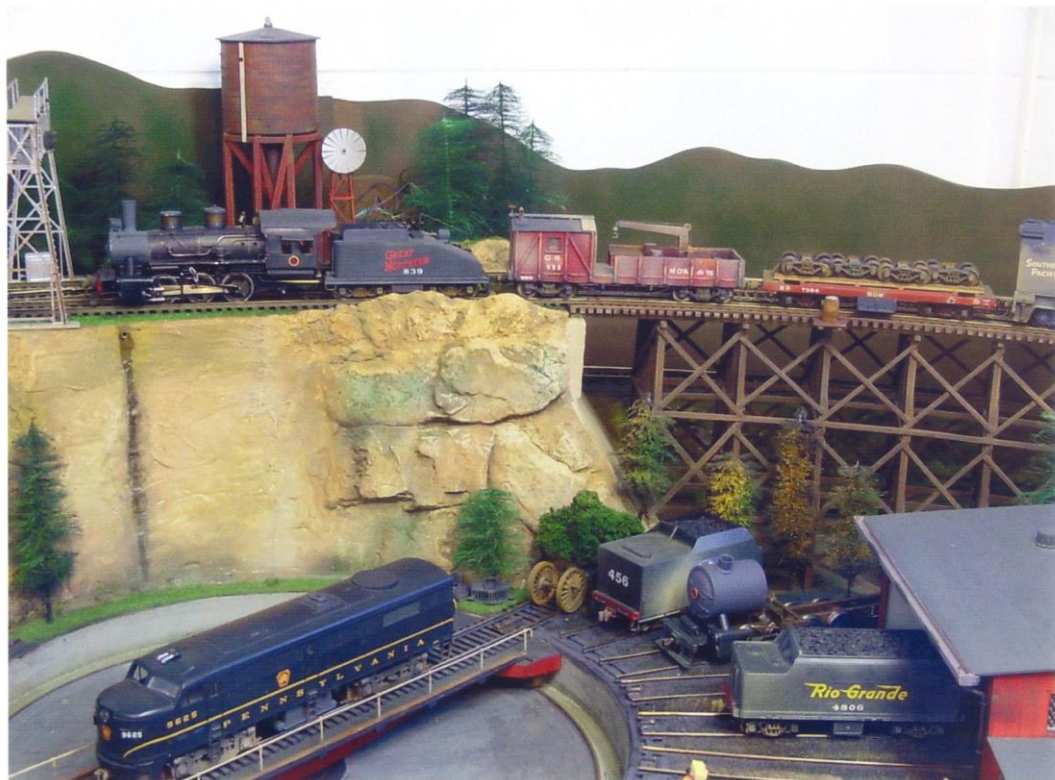
An entirely scratch built O scale layout crafted over the last 50+ years by, at 90 years of age, NSMRC's oldest member.