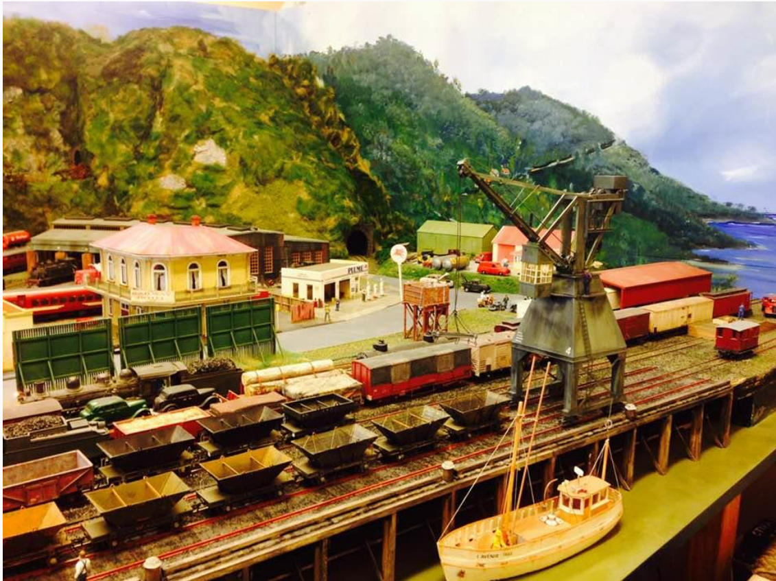
A beautifully detailed NZR S scale interpretation of the NZ West Coast railway between Greymouth and Otira.